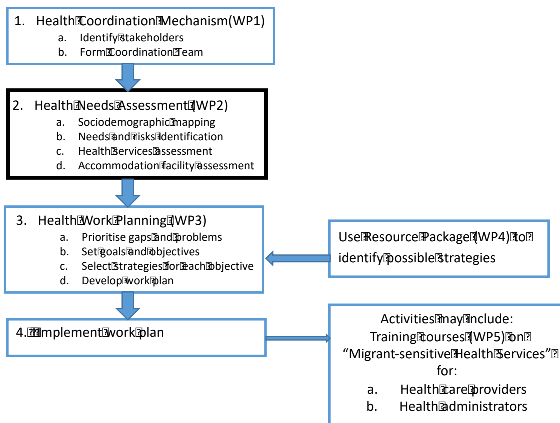
Figure 1: The SH-CAPAC Program to assist member states improve migrant health

This Guide for Assessment of Health Needs and Health Protection Resources is one of a set of work packages developed by the SH-CAPAC Project to assist European countries in their efforts to improve migrant health (See Figure 1)