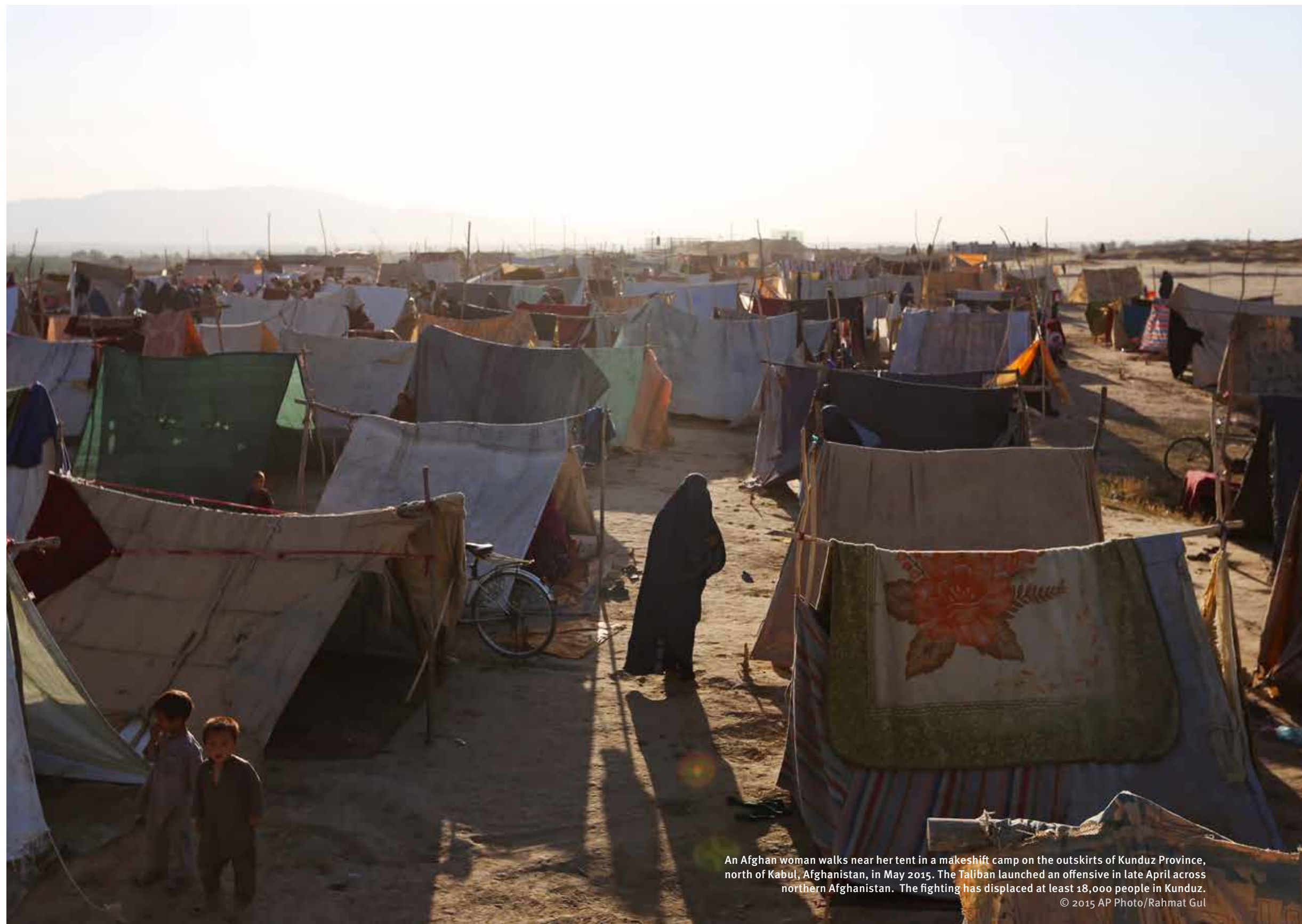
An Afghan woman walks near her tent in a makeshift camp on the outskirts of Kunduz Province, north of Kabul, Afghanistan, in May 2015. The Taliban launched an offensive in late April across northern Afghanistan. The fighting has displaced at least 18,000 people in Kunduz.