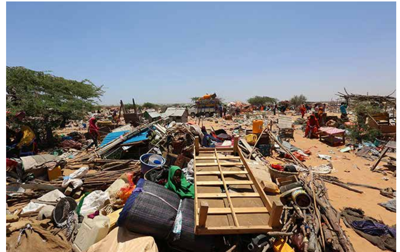
A child (left) surrounded by her family’s belongings during the massive forced eviction by Somali authorities of a displaced person’s camp in the Kadha (formerly Dharkenley) district of Mogadishu, Somalia on March 4, 2015.