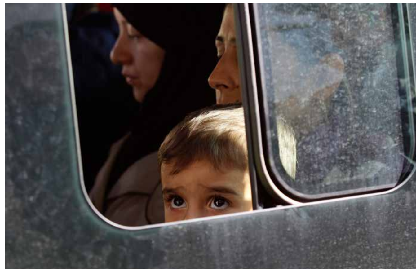
A child evacuated from a disabled cargo ship looks through a bus window, in Ierapetra on the Greek island of Crete November 27, 2014. A Greek frigate towed the cargo ship packed with 700 migrants to safety just off Crete.

Children are especially vulnerable. It is unknown how many children were among those who lost their lives trying to reach the EU between 2000 and 2014. According to Save the Children, children accounted for as many as 100 of the estimated 800 people who died in a shipwreck off the coast of Libya on April 19, 2015—the worst recorded incident. 65 In September 2014, approximately 100 children were among the 500 migrants who drowned in a shipwreck off the coast of Malta, according to witnesses. 66 When boats carrying migrants and asylum seekers capsize, children may be the most likely to drown.