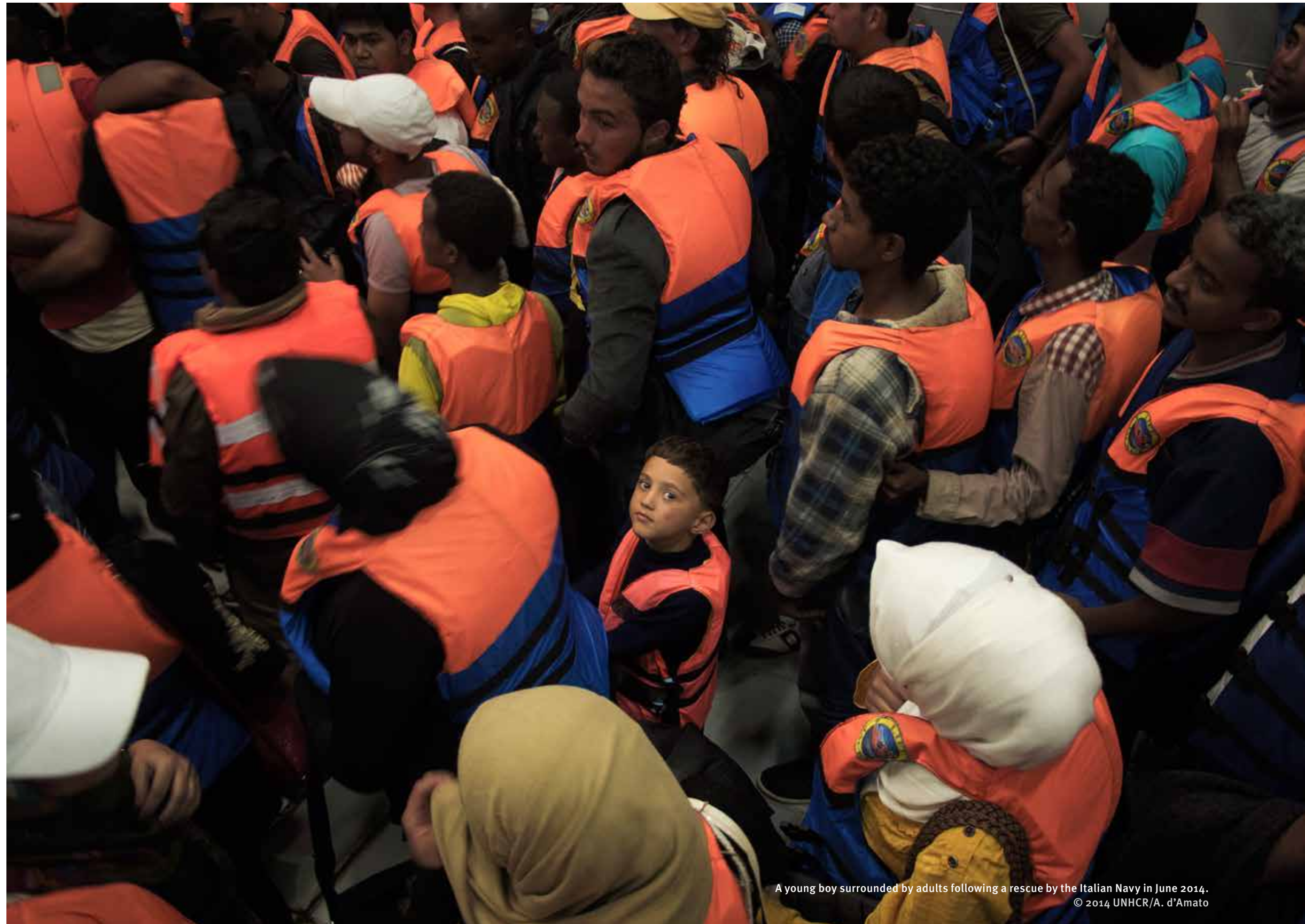
A young boy surrounded by adults following a rescue by the Italian Navy in June 2014.