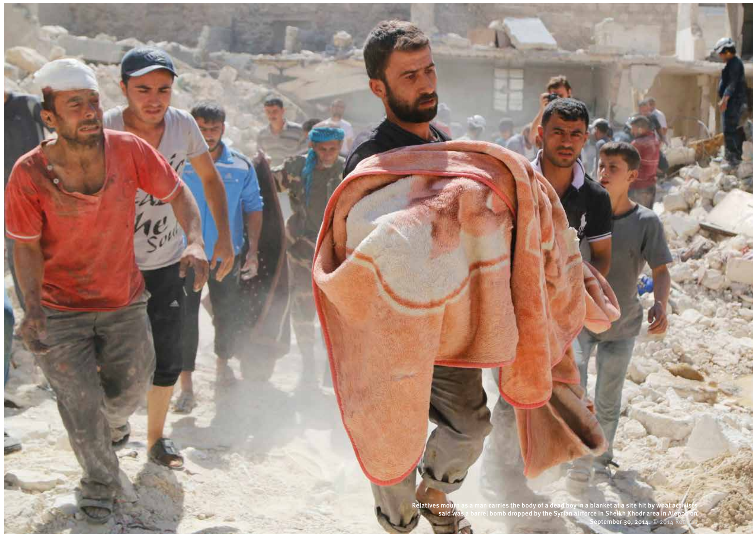
Relatives mourn as a man carries the body of a dead boy in a blanket at a site hit by what activists said was a barrel bomb dropped by the Syrian airforce in Sheikh Khodr area in Aleppo on September 30, 2014.