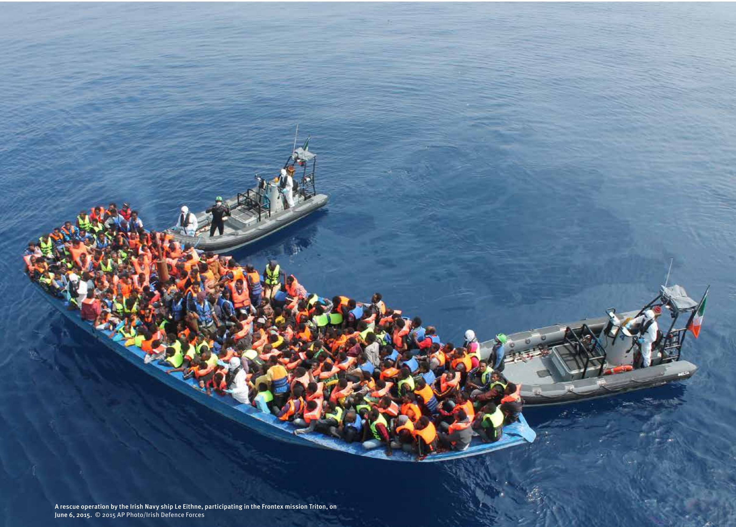
A rescue operation by the Irish Navy ship Le Eithne, participating in the Frontex mission Triton, on June 6, 2015.