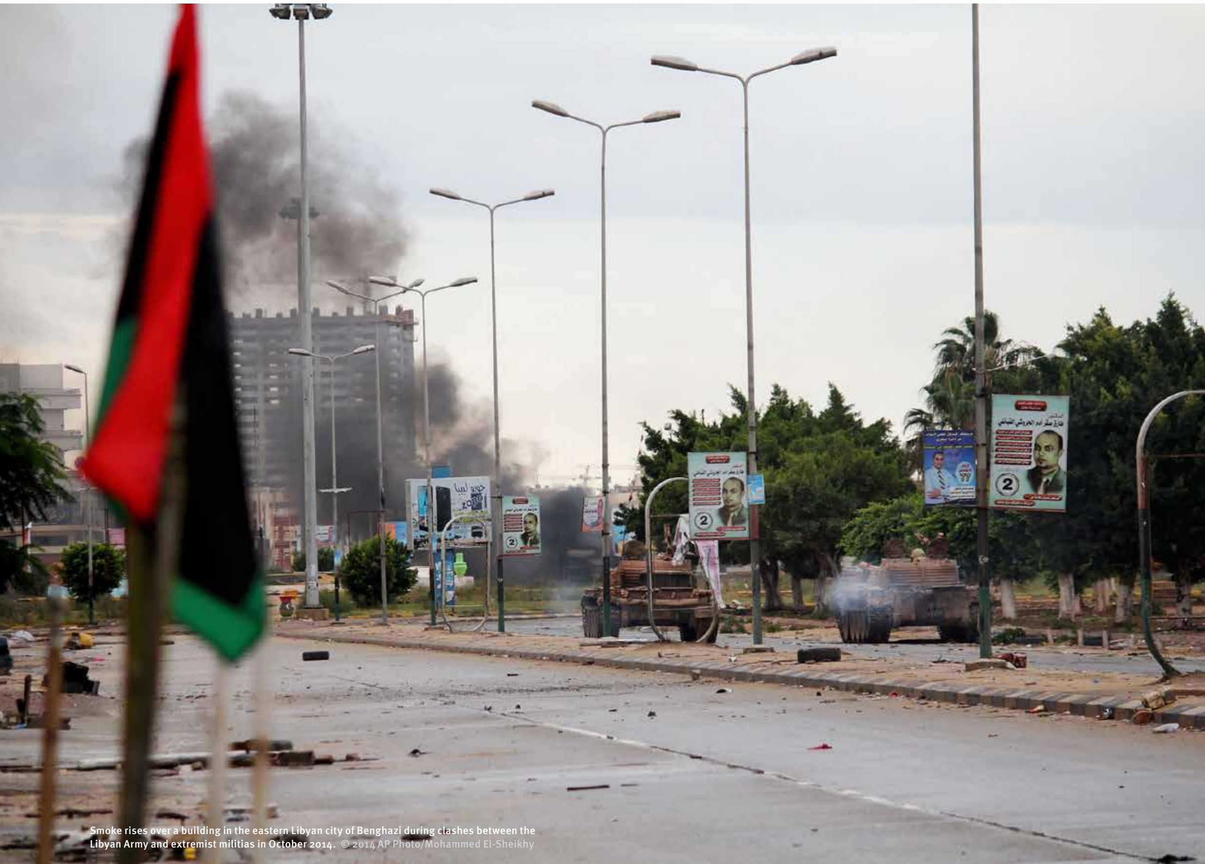
Smoke rises over a building in the eastern Libyan city of Benghazi during clashes between the Libyan Army and extremist militias in October 2014.