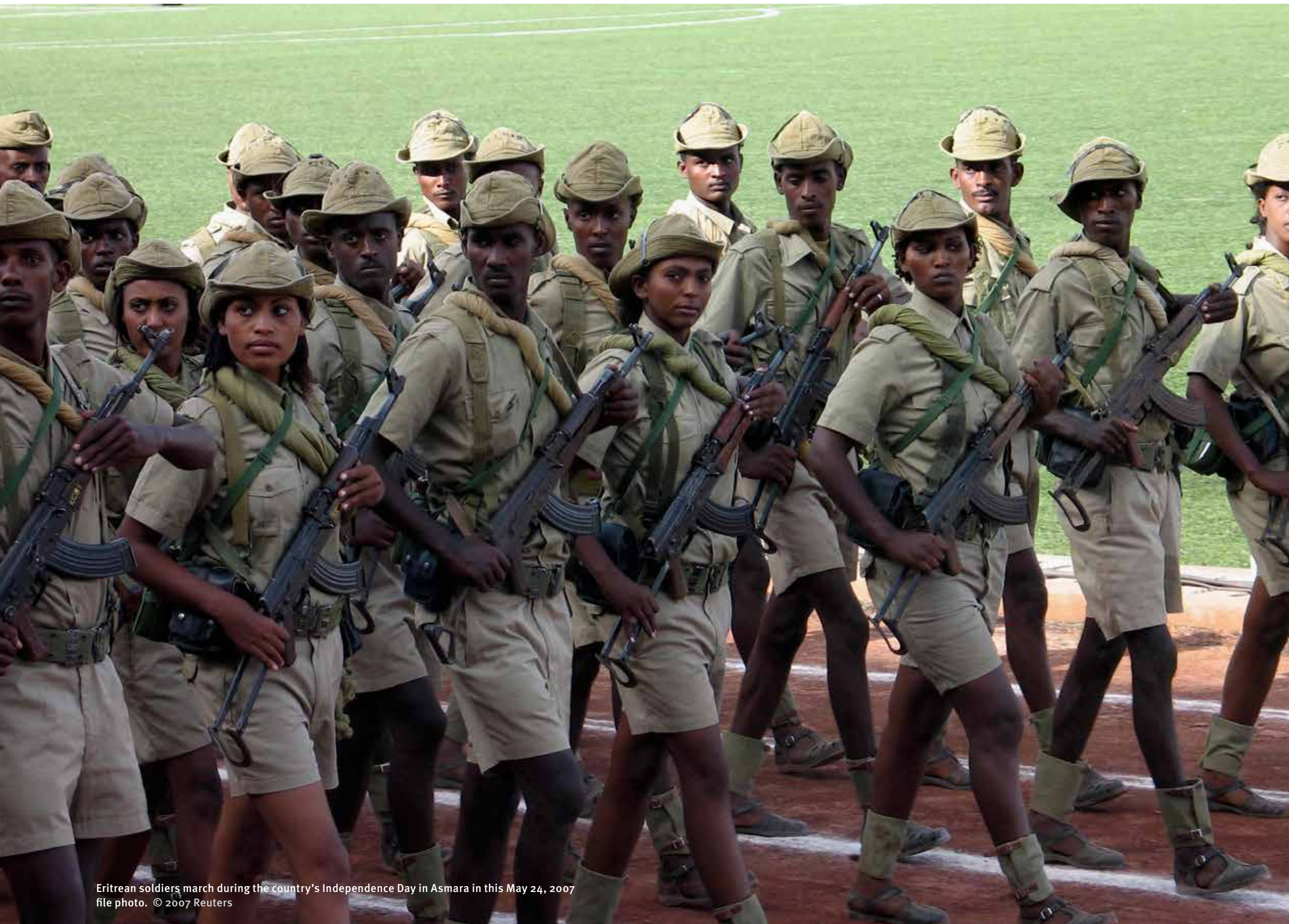
Eritrean soldiers march during the country's Independence Day in Asmara in this May 24, 2007 file photo.